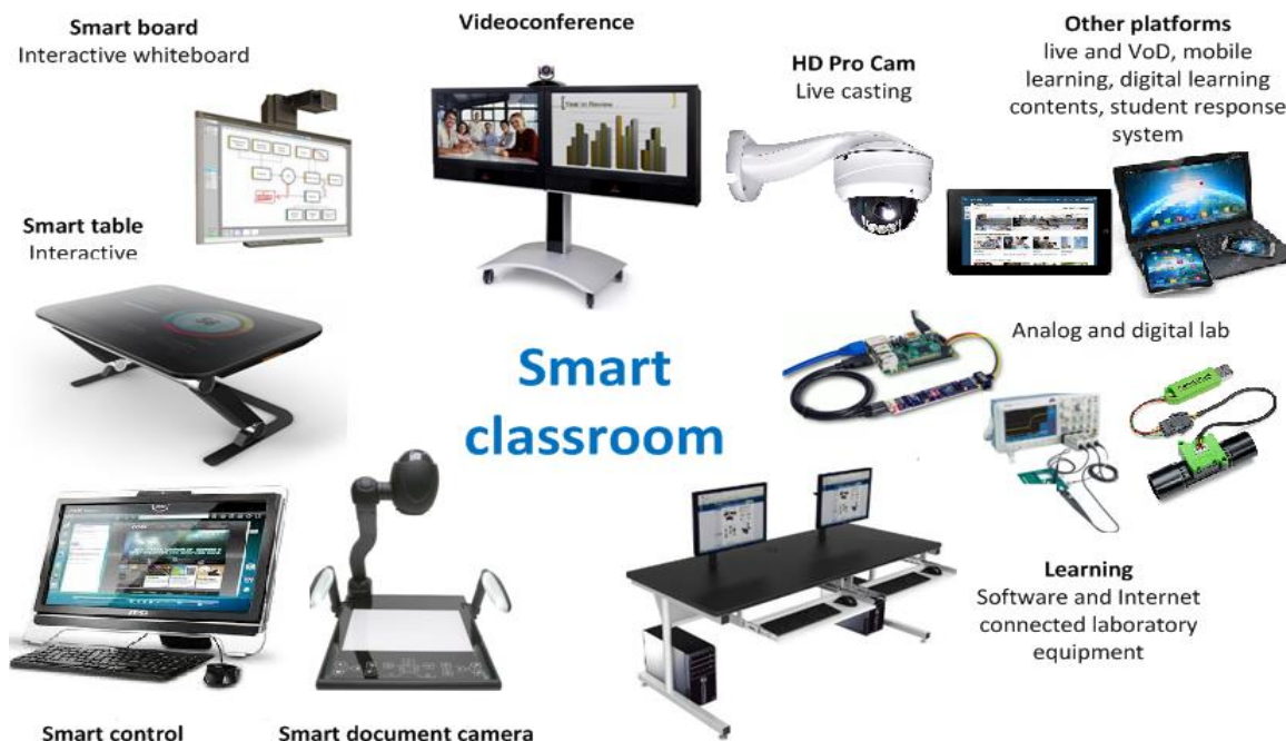
Figure 1. Smart and interactive environment at engineering education institution

The intensive technology advancements have dramatically changed the classroom in the last decade. The Internet of Things (IoT), which refers to the internetworking of Internet-aware devices, has played the significant role in transforming education processes. With the help of sensor technologies, radio frequency identification (RFID), Cloud computing technologies, big data analytics, and e-learning platforms, the vision of smart and interactive classroom, consisted of smart devices that have Internet capabilities and can be controlled and tracked through the Internet, becomes reality (Fig. 1). In the other words, smart technology and Internet connectivity have changed the approach of how the universities teach and students learn [1].